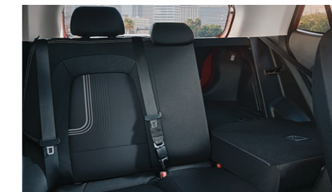
60/40 split-folding rear seats