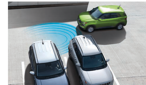
Rear Cross-Traffic Collision Warning