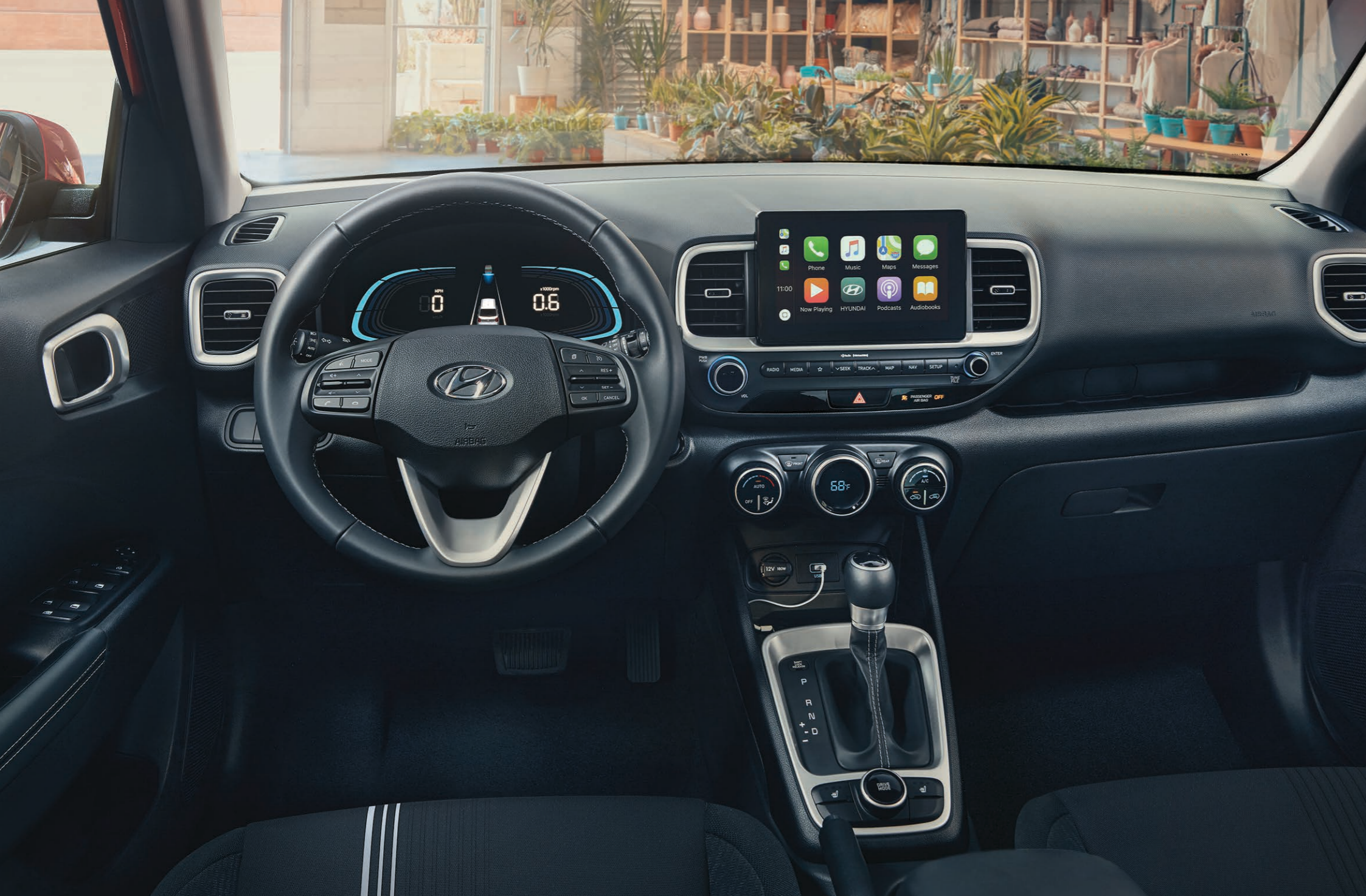
VENUE Limited in Black Cloth/Leatherette