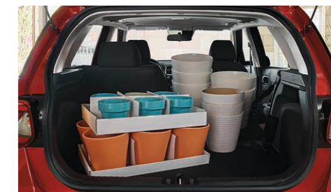
Versatile cargo area