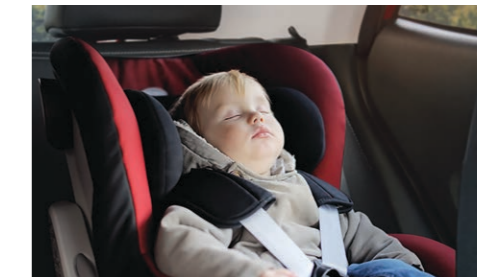
Rear Occupant Alert