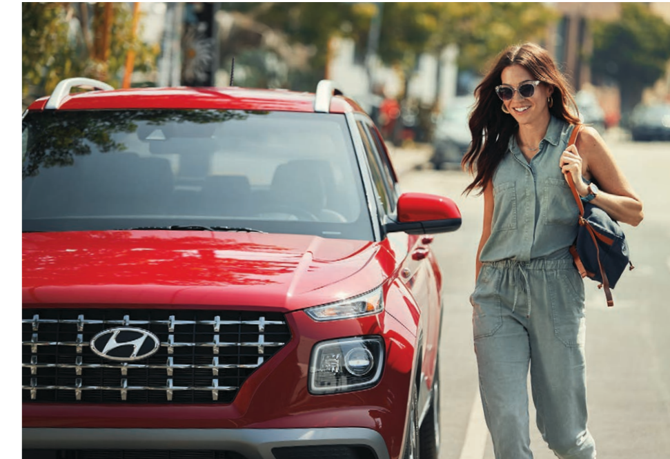
Proximity Key with push button start