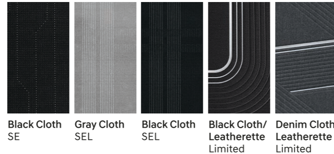
Black Cloth SE Gray Cloth SEL Black Cloth SEL Black Cloth/Leatherette Limited Denim Cloth/Leatherette Limited