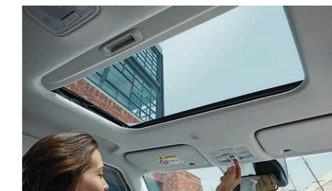
Power tilt-and-slide sunroof