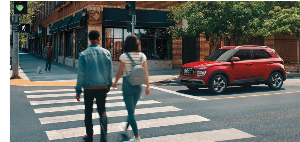
Forward Collision-Avoidance Assist with Pedestrian Detection

Venue's safety engineering goes all the way to its core with a body constructed of advanced high-strength steel. And zones designed to absorb and disperse impacts, helping to protect you and your passengers inside the cabin.