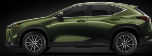
NORI GREEN PEARL