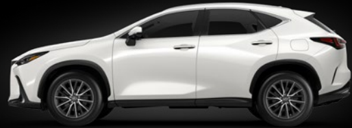
EMINENT WHITE PEARL*