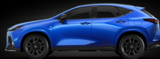
ULTRASONIC BLUE MICA 2.0*