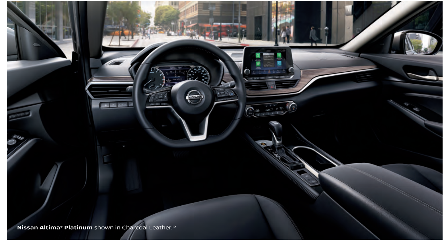
Nissan Altima ® Platinum shown in Charcoal Leather. 19