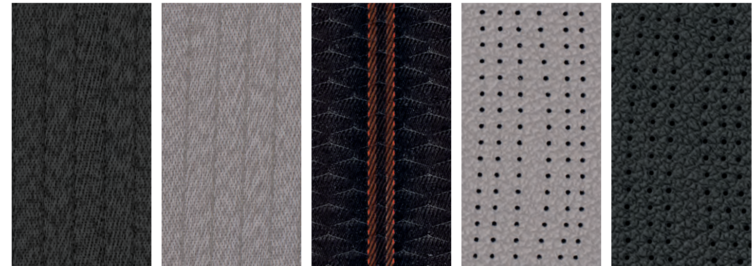
Charcoal Cloth s|SV Gray Cloth SV Charcoal Sport Cloth SR Gray Leather 19 SL|Platinum Charcoal Leather 19 SL|Platinum