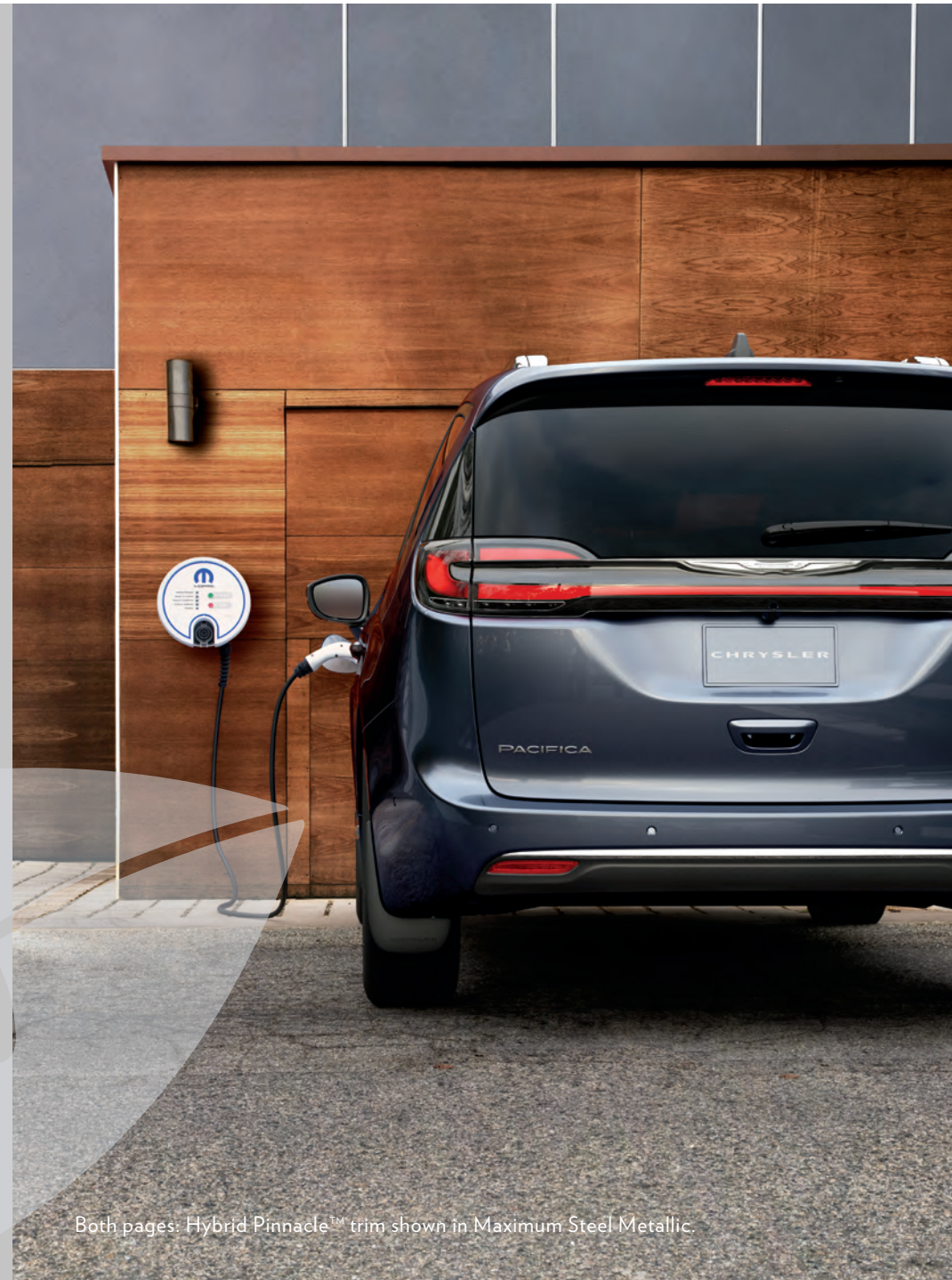
Both pages: Hybrid Pinnacle™ trim shown in Maximum Steel Metallic.

-MILE PROJECTED ALL-ELECTRIC DRIVING RANGE 8