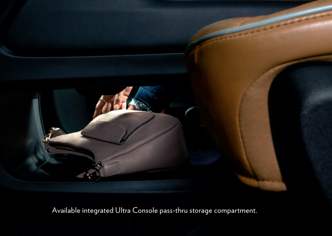
Available integrated Ultra Console pass-thru storage compartment.