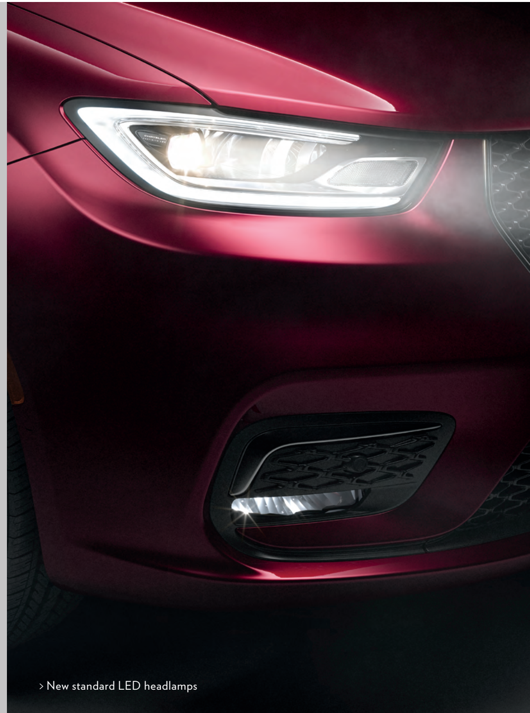
> New standard LED headlamps