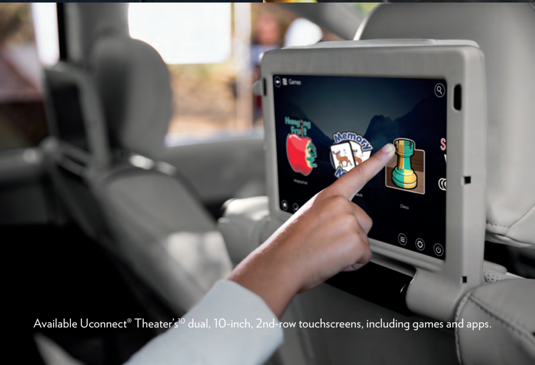
Available Uconnect ® Theater's 10 dual, 10-inch, 2nd-row touchscreens, including games and apps.