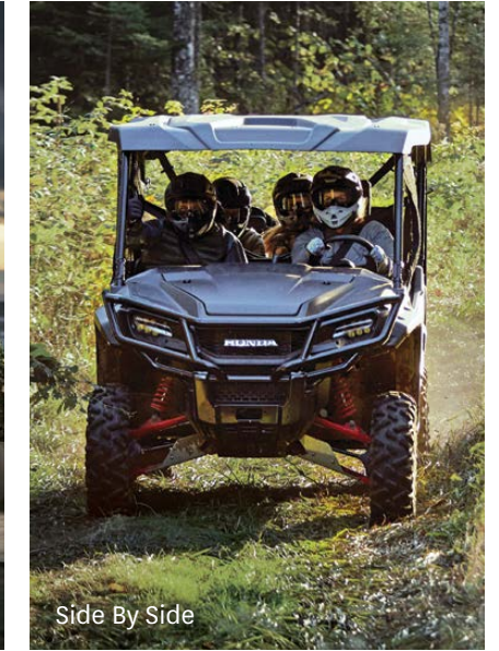
Side By Side