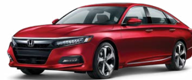
Radiant Red Metallic