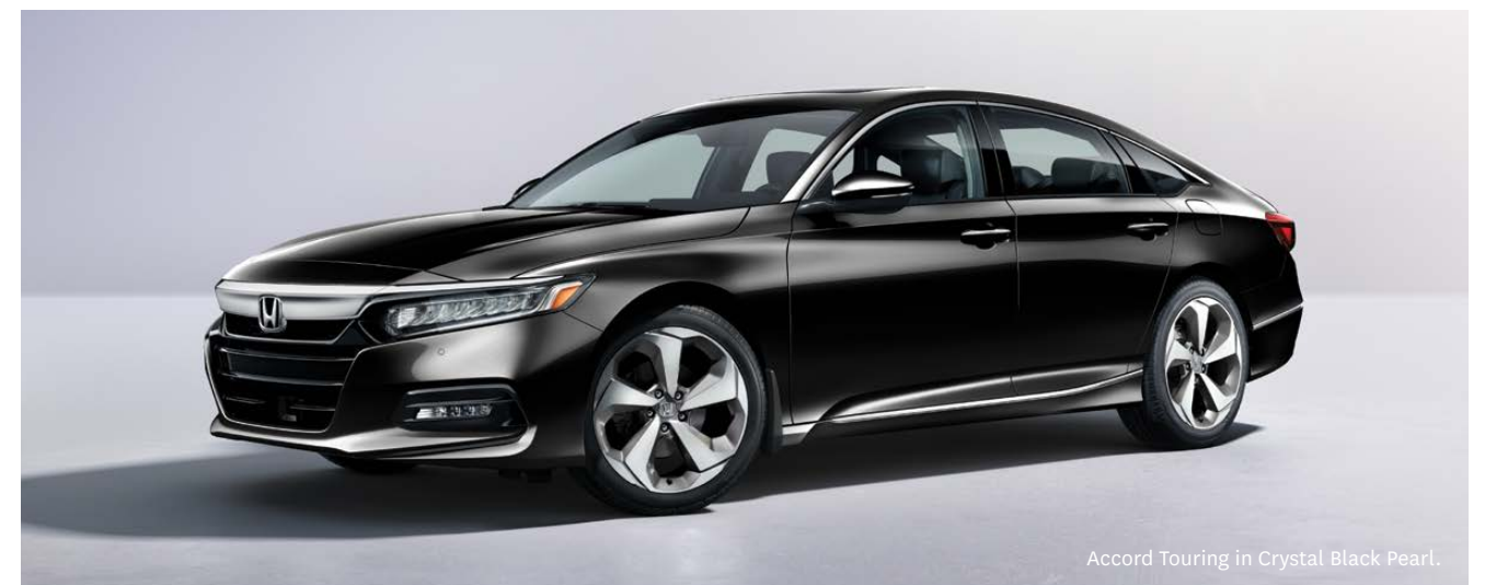
Accord Touring in Crystal Black Pearl.