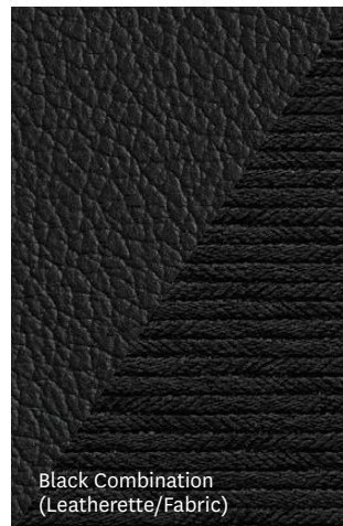
Black Combination (Leatherette/ Fabric)

Perception of colour may vary when combined with blazing sun and high speeds.