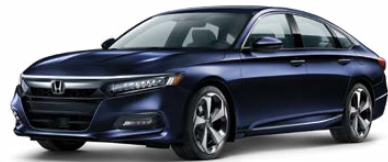
Obsidian Blue Pearl