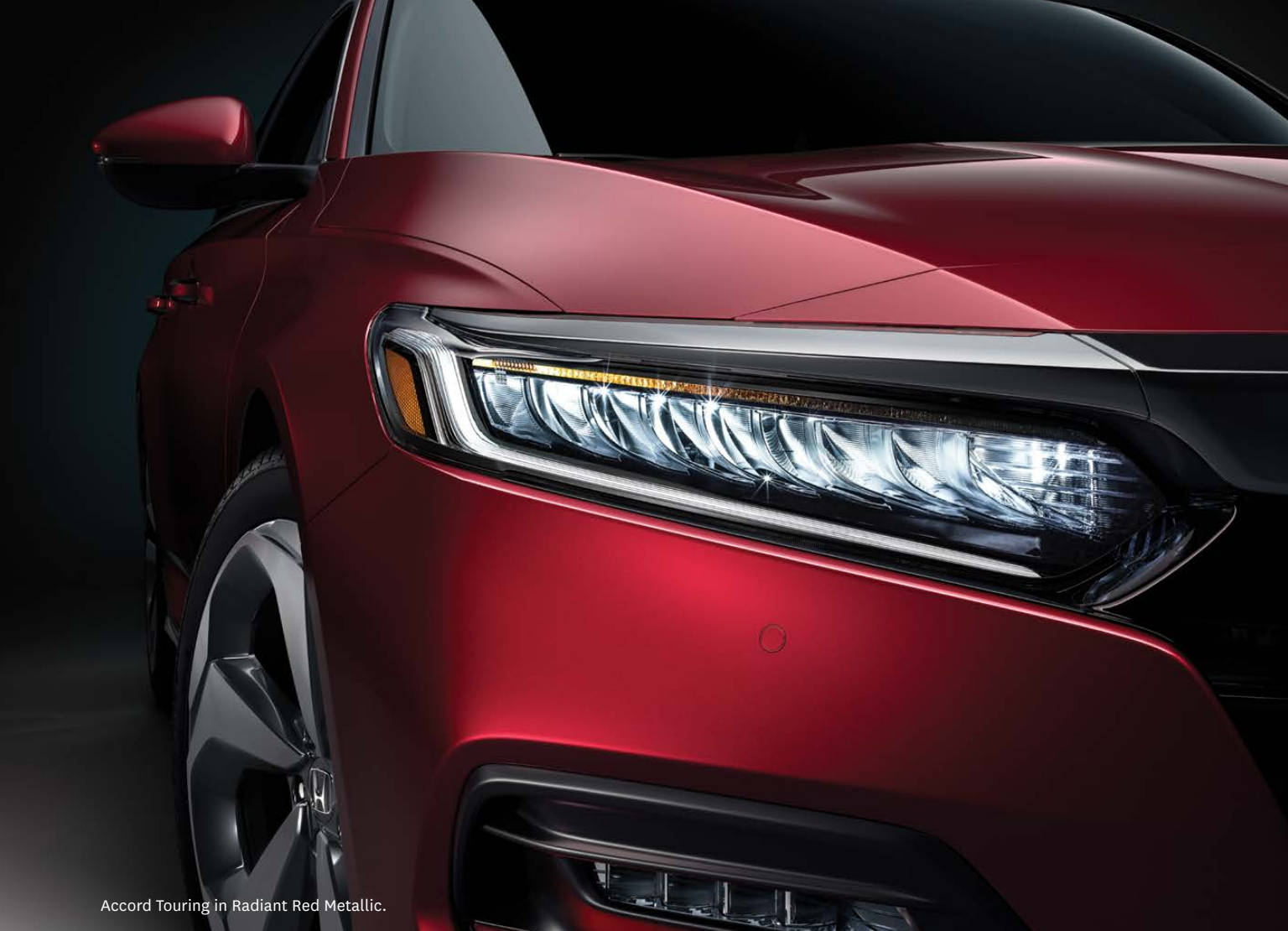
Accord Touring in Radiant Red Metallic.