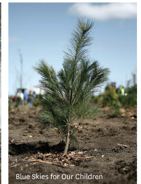
Blue Skies for Our Children