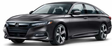
Modern Steel Metallic