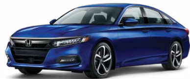
Still Night Pearl