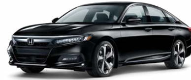
Crystal Black Pearl