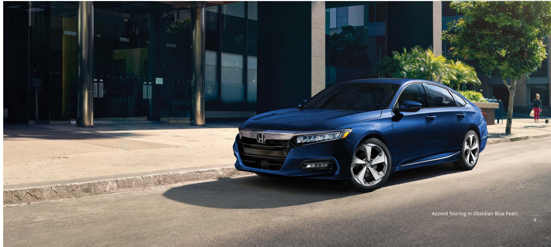
Accord Touring in Obsidian Blue Pearl.