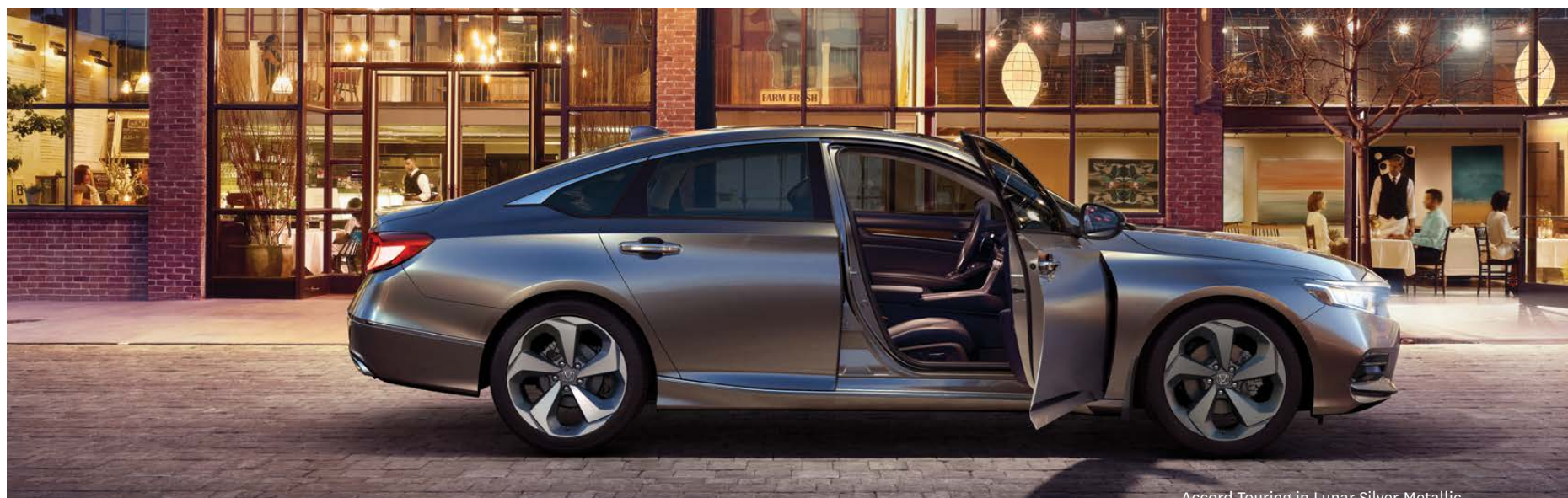
Accord Touring in Lunar Silver Metallic.