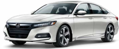
Platinum White Pearl