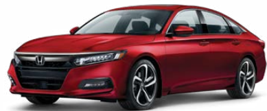
San Marino Red