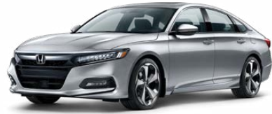
Lunar Silver Metallic