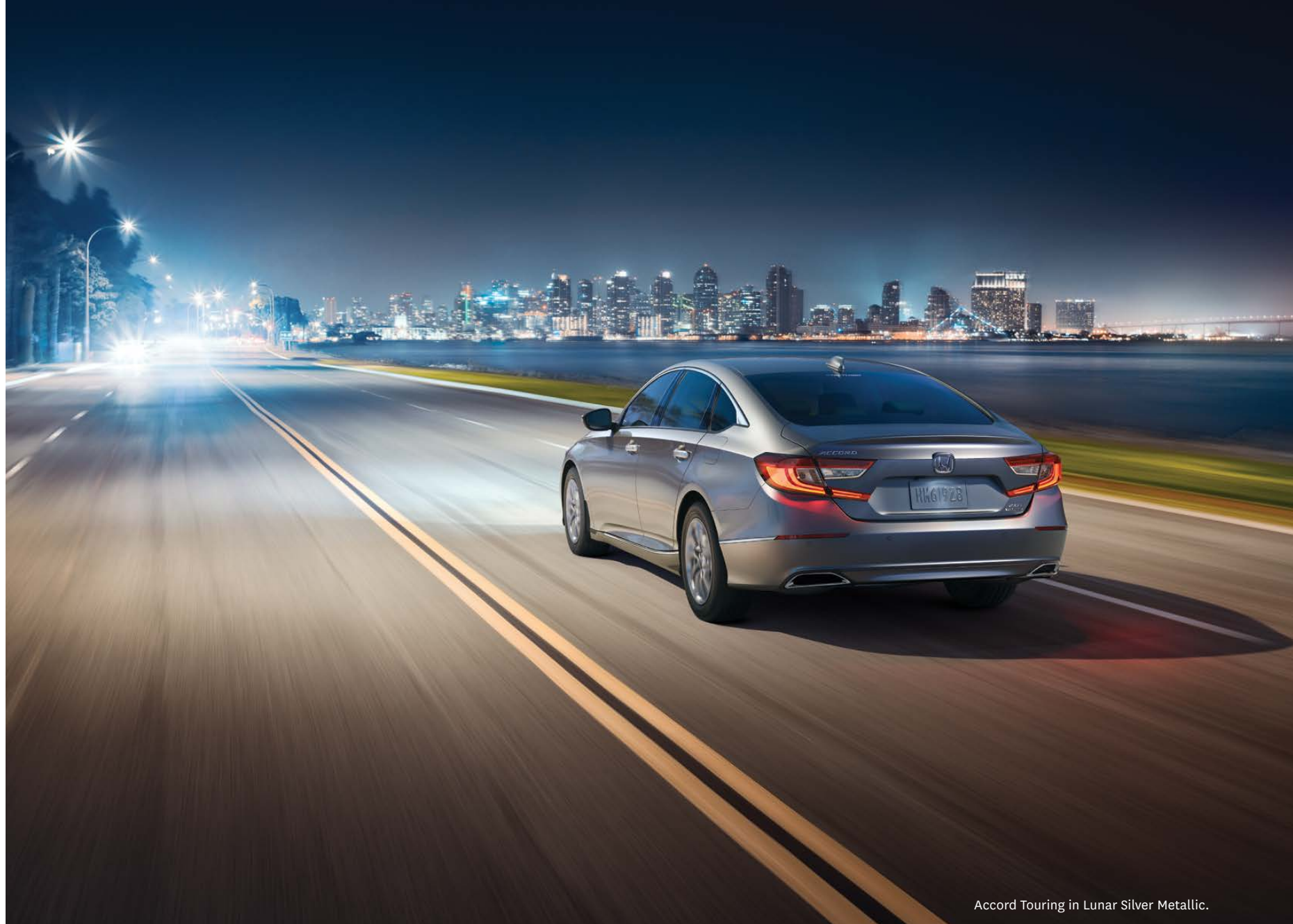
Accord Touring in Lunar Silver Metallic.