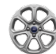
16" SHADOW SILVER-PAINTED ALUMINUM Standard

1.0L ECOBOOST® WITH AUTO START-STOP TECHNOLOGY 6-SPEED SELECTSHIFT® AUTOMATIC TRANSMISSION