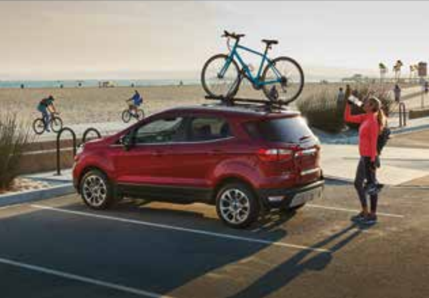
Titanium in Ruby Red Metallic Tinted Clearcoat accessorized with hood deflector, side window deflectors, 1 front and rear molded splash guards, keyless entry keypad, roof crossbars, 1 roof-mounted bike carrier, 1,2 and wheel lock kit