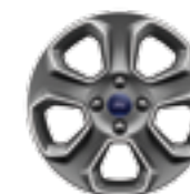
16" LOW-GLOSS MAGNETIC-PAINTED MACHINED-FACE ALUMINUM Standard