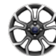
17" PAINTED MACHINED ALUMINUM Standard