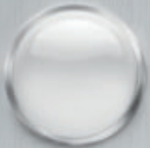
CLEAR WHITE (FE, LX, S)

YOU UNDERSTAND THE UPS AND DOWNS OF LIFE AND NEVER LET A CLOUDY DAY GET YOU DOWN.