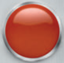
FIRE ORANGE (EX LAUNCH EDITION)

YOU SEEK ADVENTURE AND ARE THE LIFE OF THE PARTY. NO CHILI PEPPER IS OFF LIMITS TO YOU.