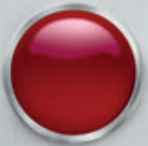
CURRANT RED (LX, S, EX)

YOU ARE OPEN TO EXPLORING ENDLESS POSSIBILITIES. YOUR GLASS IS ALWAYS HALF-FULL.