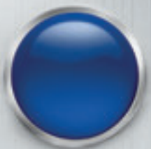
DEEP SEA BLUE (LX, S)

YOU NOTICE THE SUBTLE IRONIES IN LIFE. NOTHING IS EVER BLACK AND WHITE TO YOU.