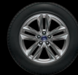
18" Sparkle Silver-Painted Split-Spoke Aluminum available with optional snow chain-compatible tires Standard