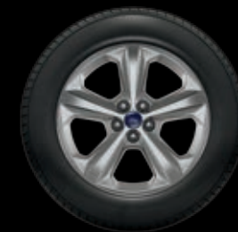
18" Sparkle Silver-Painted Aluminum Standard