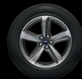
18" Bright-Machined Aluminum with Premium Dark Stainless-Painted Pockets requires SEL 201A; available with optional snow chain-compatible tires Optional