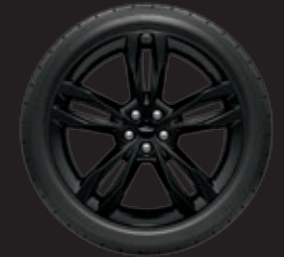
21" Premium Gloss Black-Painted Aluminum included in ST Performance Brake Package 3 Available