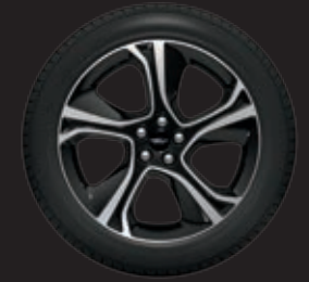
20" Bright-Machined Aluminum with High-Gloss Black-Painted Pockets Standard