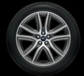
20" Bright-Machined Aluminum with Premium Dark Stainless-Painted Pockets included with the Titanium Elite Package; optional on 300A Available