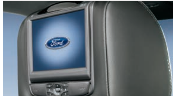
Rear Seat Entertainment System 1