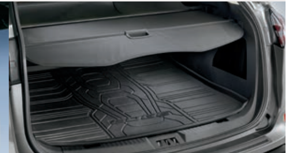
Interior cargo cover and cargo area protector