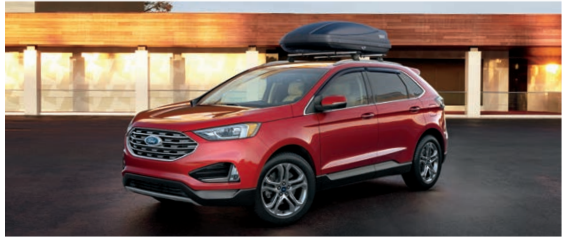
Titanium in Ruby Red Metallic Tinted Clearcoat accessorized with smoked side window deflectors, 1 front and rear molded splash guards, roof-mounted crossbars and cargo box, 1,2 and wheel lock kit

Comparisons based on competitive models excluding other Ford vehicles (class is Midsize Utilities based on Ford segmentation), publicly available information and Ford certification data at time of release. Vehicles may be shown with optional equipment. Features may be offered only in combination with other options or subject to additional ordering requirements/limitations. Dimensions shown may vary due to optional features and/or production variability. Information is provided on an "as is" basis and could include technical, typographical or other errors. Ford makes no warranties, representations, or guarantees of any kind, express or implied, including but not limited to, accuracy, currency, or completeness, the operation of the information, materials, content, availability, and products. Ford reserves the right to change product specifications, pricing and equipment at any time without incurring obligations. Your Ford Dealer is the best source of the most up-to-date information on Ford vehicles. Colors are representative only. See your dealer for actual paint/trim options.