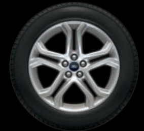
19" Nickel-Painted Aluminum Standard