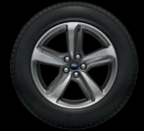
18" Bright-Machined Aluminum with Premium Dark Stainless-Painted Pockets requires snow chain-compatible tires; not available with Titanium Elite Package Optional

Add refinement to your driving experience with this well-appointed Edge. Titanium adds the ultra-convenient hands-free foot-activated liftgate, 19" Nickel-painted aluminum wheels, LED signature lighting up front, and LED taillamps with amber turn signals in the rear. Inside, luxury amenities include: a new 12-speaker B&O Sound System; new wireless charging pad; 10-way power, heated, leather-trimmed driver and front-passenger seats; a power-tilt/-telescoping steering column with memory; SYNC ® 3; a 110V/150W AC power outlet; illuminated front door-sill scuff plates; and ambient lighting. It's easy to hit all the right notes in Edge Titanium .