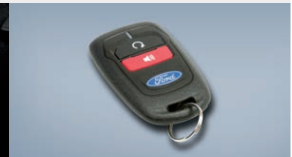
Remote start systems