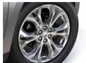
20" Cast Aluminum With Premium Pearl Nickel Finish Exclusive to Avenir.