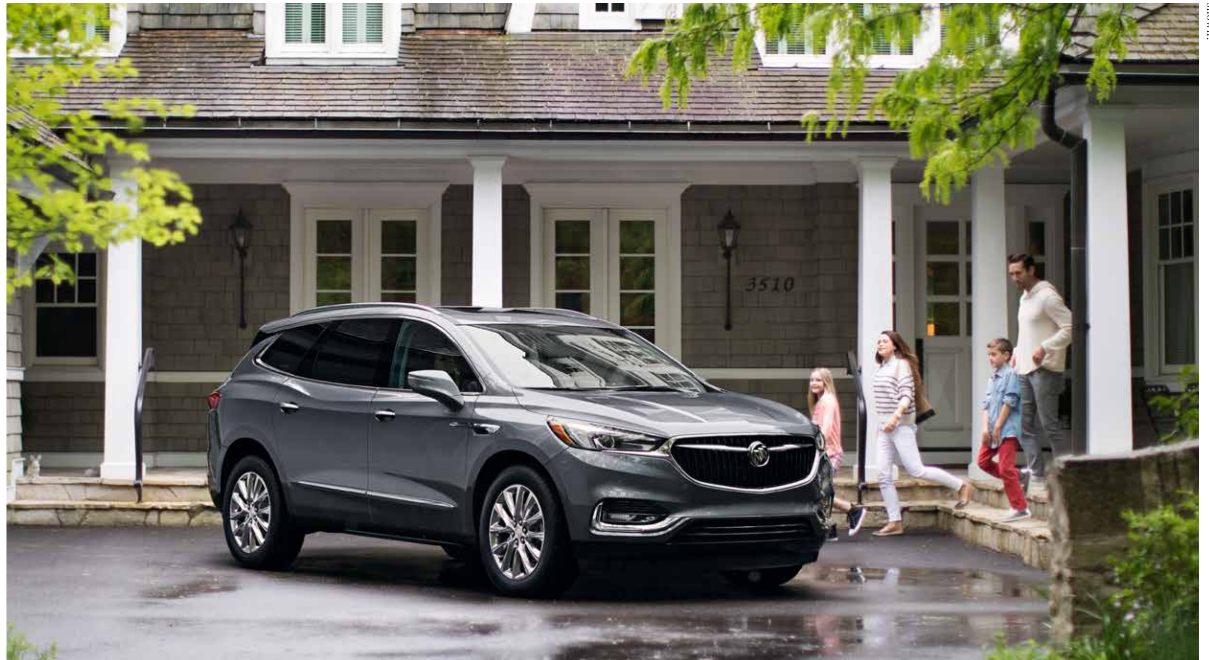
Enclave Premium shown in Satin Steel Metallic with available features. Bottom right, available dealer-installed accessories shown.

Wherever you're headed, Enclave helps you arrive with style and purpose. Every detail doubles as a statement. Dynamic lines convey Enclave's athletic performance. The intricate surfaces of the grille embody its elevated design. And a hands-free power liftgate reflects its suite of intuitive features. Style and substance have never worked so well together.