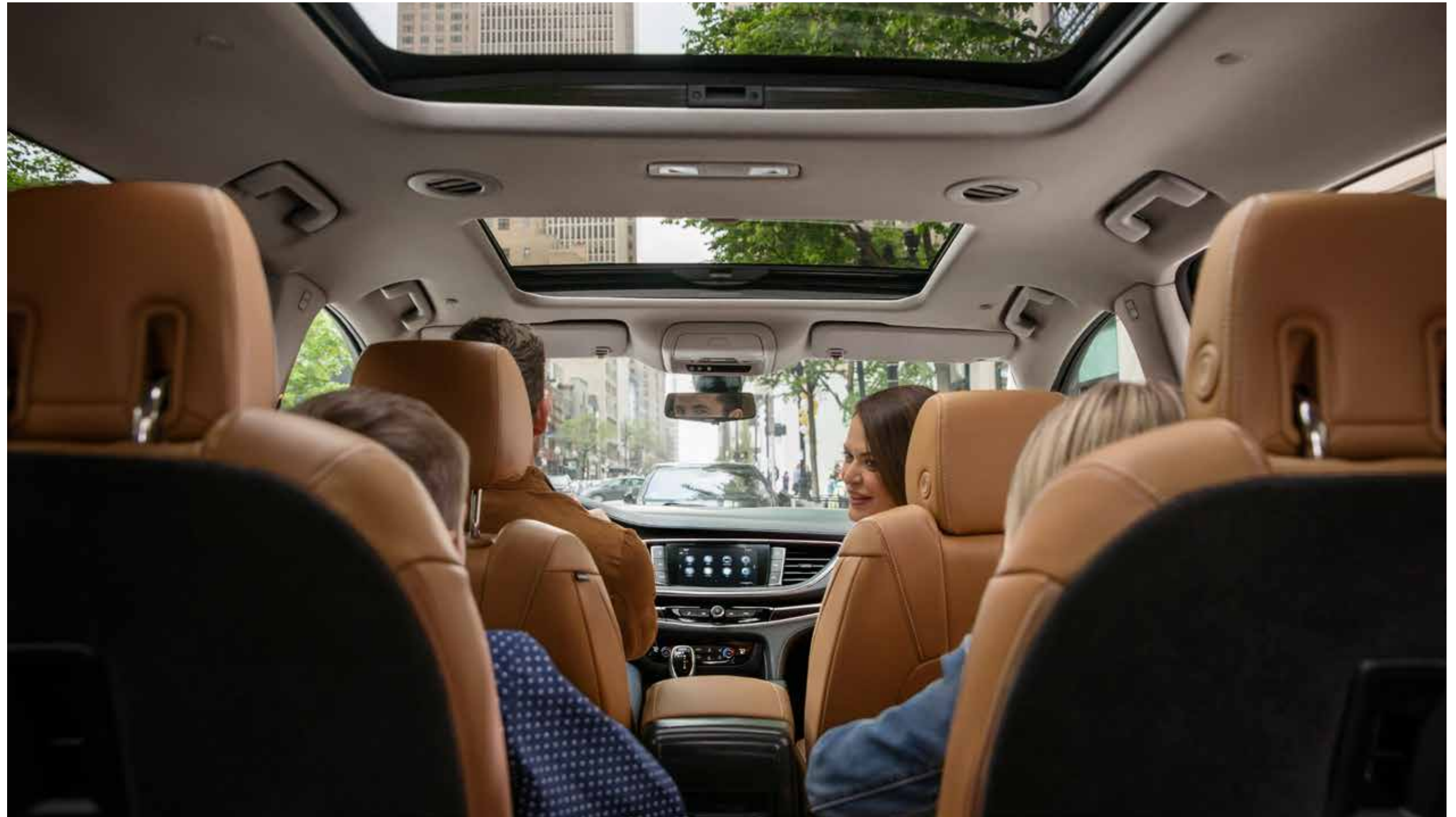
Enclave Premium interior shown in Brandy with Ebony accents and available features.