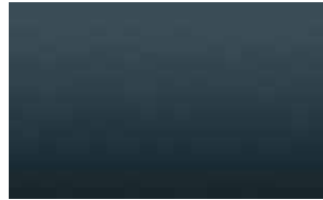
Dark Slate Metallic 1,3