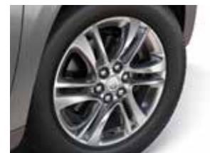
18" Bright Silver Cast Aluminum Standard on Preferred, Essence and Premium.