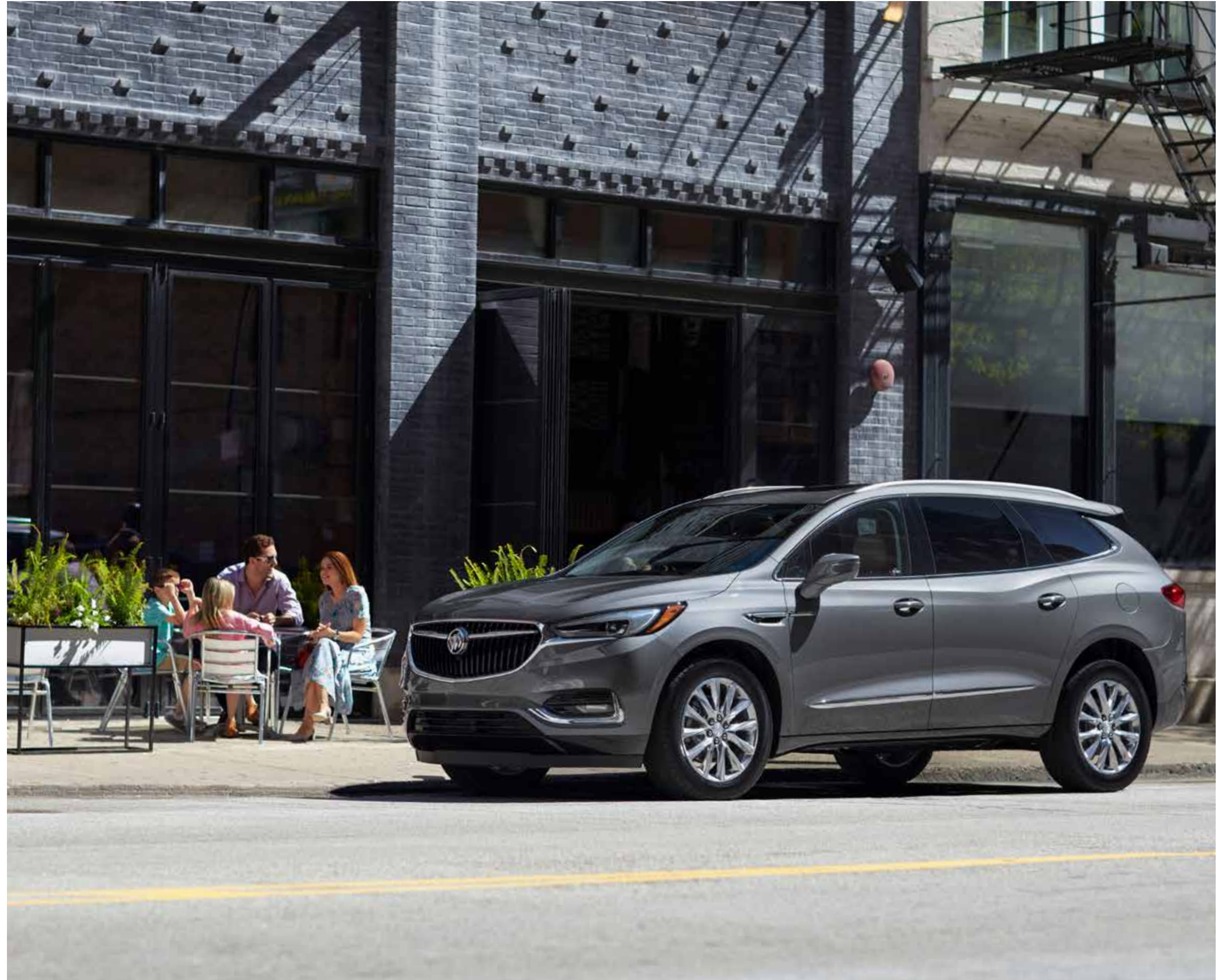
Enclave Premium shown in Satin Steel Metallic with available features.

Buick Enclave combines three rows of luxury seating for up to seven with SUV capability to create a premium experience where every moment feels extraordinary. Enclave's striking shape flows seamlessly from its winged headlamps with LED signature lighting all the way to its sculpted rear profile. It's a fusion of form and function that ensures time spent together is time well spent.