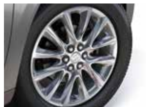
20" Polished Cast Aluminum Available on Essence and Premium, included in the Experience Buick Package.