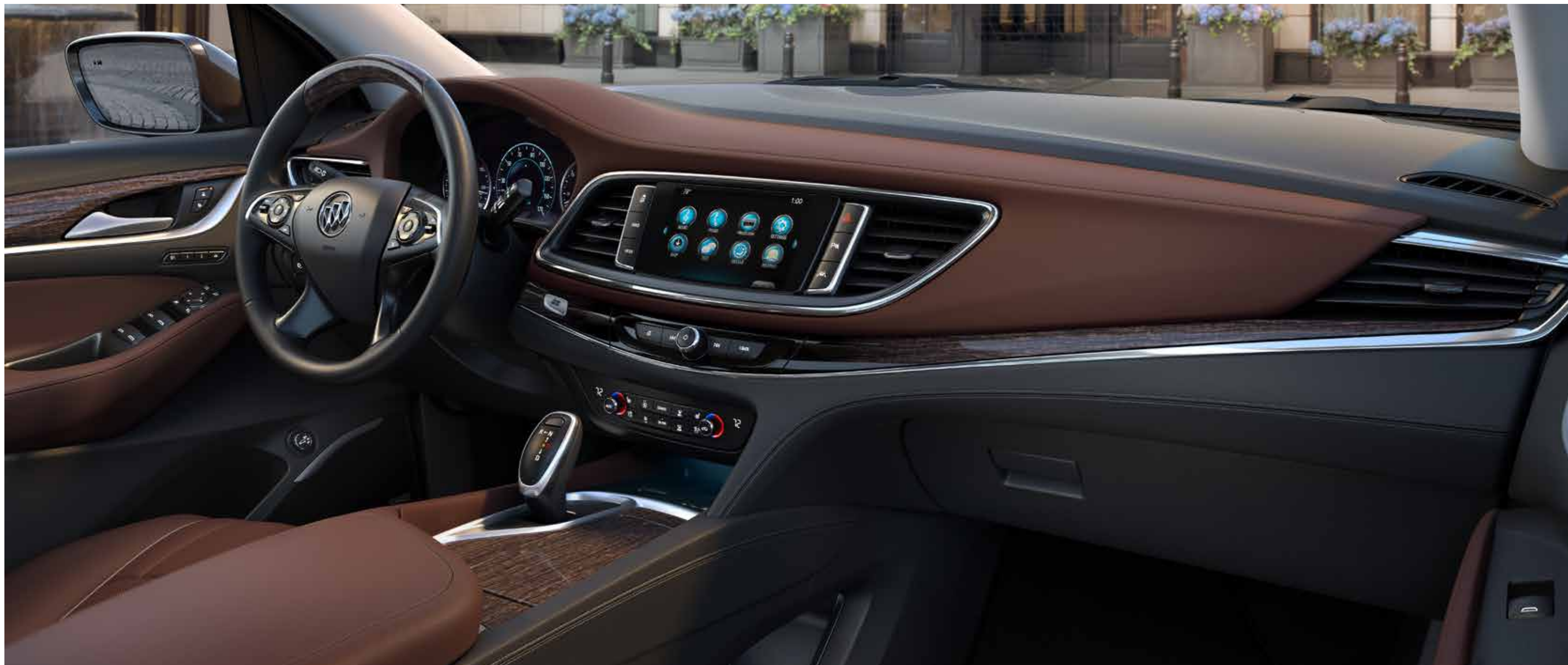
Enclave Avenir interior shown in Chestnut with Ebony accents and available features.

PREMIUM MATERIALS From its sweeping surfaces to its meticulously crafted wood-tone trim, Enclave Avenir welcomes you into an environment where each tone and texture conveys the highest level of refinement.