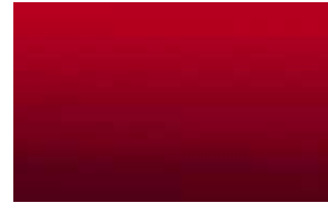
Red Quartz Tintcoat 1,2