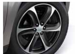
20" Bright Machine-Faced Aluminum With Satin Graphite Painted Finish Dealer-installed accessory wheel. Available on Preferred, Essence and Premium 10

10 Use only GM-approved tire and wheel combinations. See buick.com/accessories for more important tire and wheel information, or see your dealer.