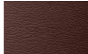
Chestnut Perforated Leather-Appointed Seating 9

Ebony accents included with all interior colors. Leather-appointed seating first and second rows only.