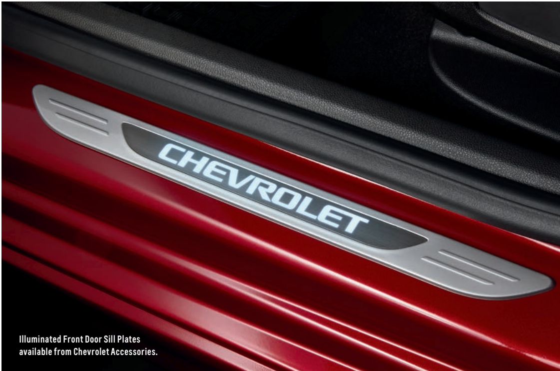
Illuminated Front Door Sill Plates available from Chevrolet Accessories.