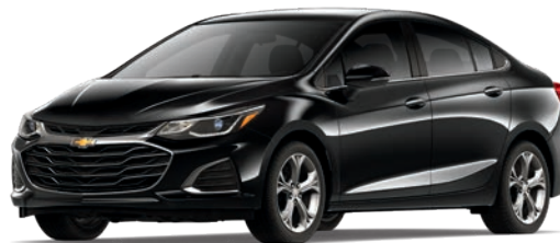
MOSAIC BLACK METALLIC 3,6