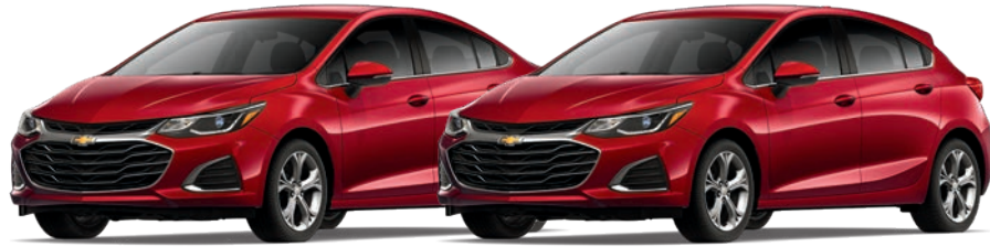
CAJUN RED TINTCOAT 1,2