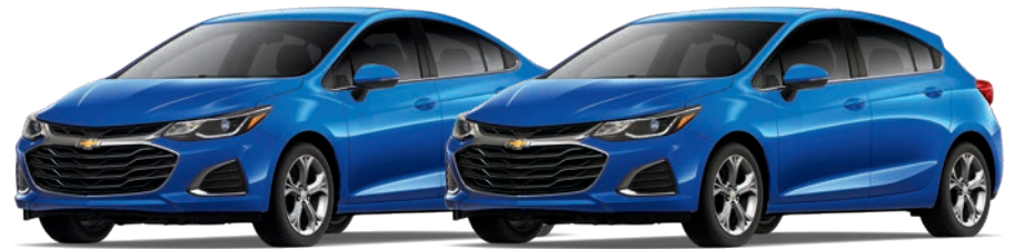
KINETIC BLUE METALLIC 1,2