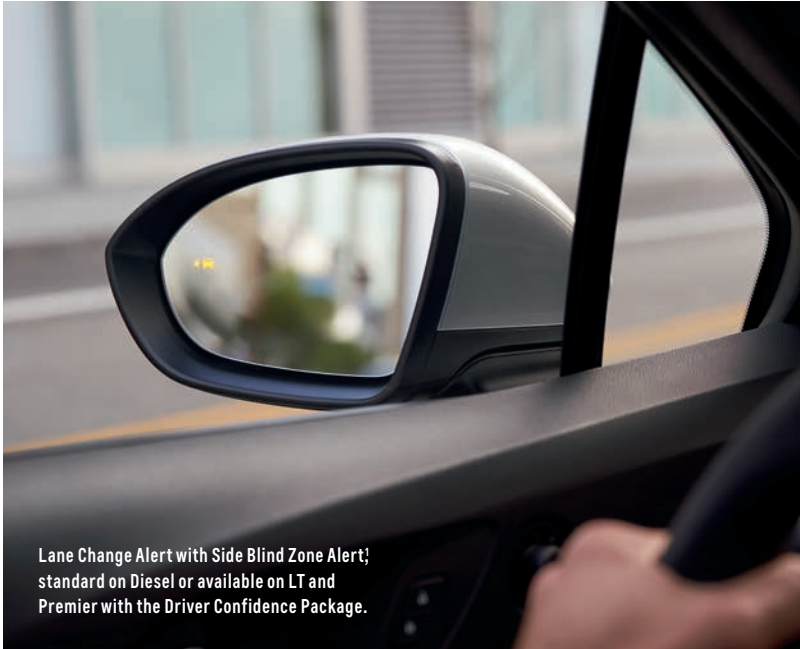
Lane Change Alert with Side Blind Zone Alert, 1 standard on Diesel or available on LT and Premier with the Driver Confidence Package.