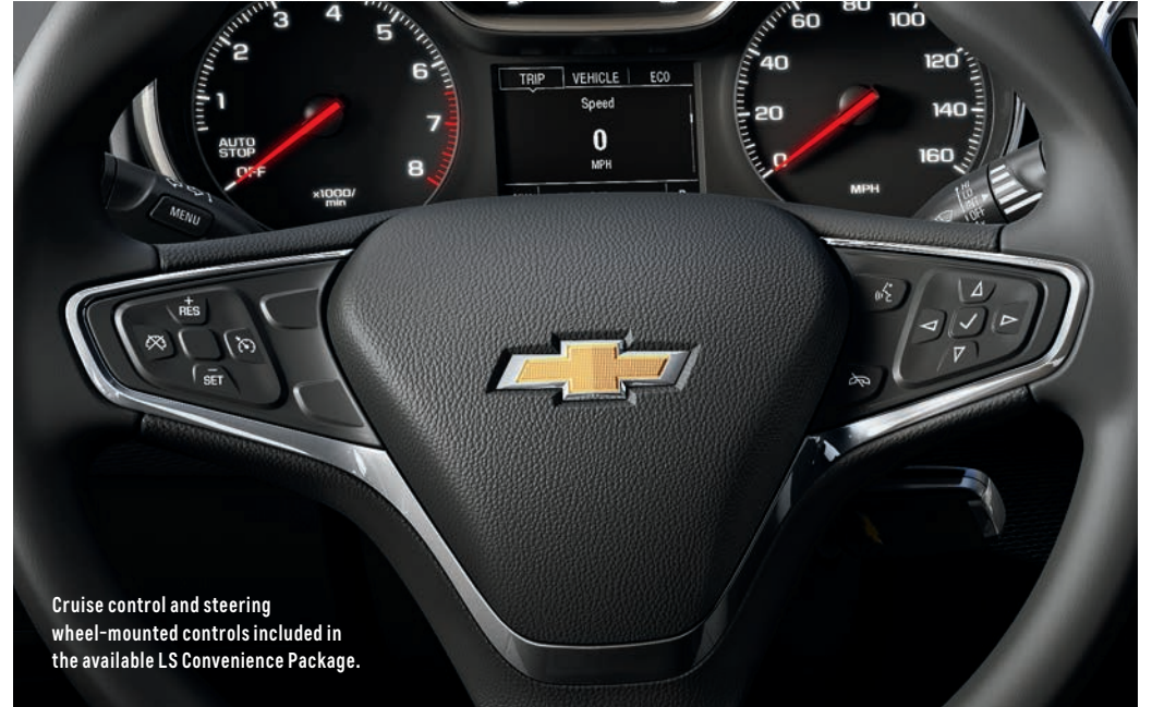
Cruise control and steering wheel-mounted controls included in the available LS Convenience Package.