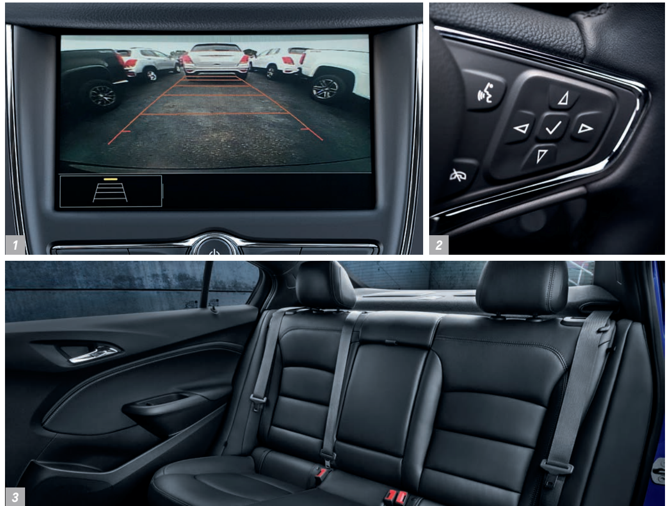
1 Read the vehicle Owner's Manual for important feature limitations and information. 2 Does not detect people or items. Always check rear seat before exiting.

Rear Seat Reminder 2 activates when the rear doors are opened and closed up to 10 minutes before or anytime while your vehicle is on, so when you turn off the engine, under certain conditions, you will get a reminder to double-check for valuables left behind.