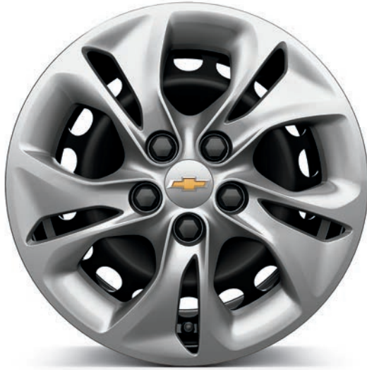
15" Steel with Painted Wheel Cover (Standard on L and LS)