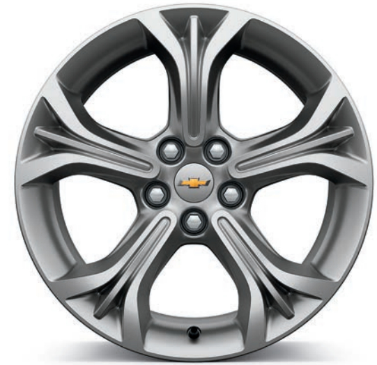
17" Aluminum (Standard on Premier)