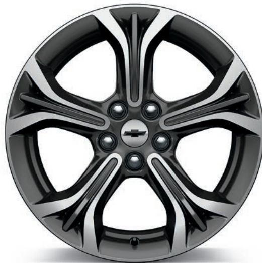
17" Aluminum (Included with RS Package on LT)