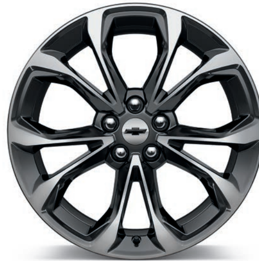
18" Machined-Face Aluminum (Included with RS Package on Diesel Hatchback and Premier)