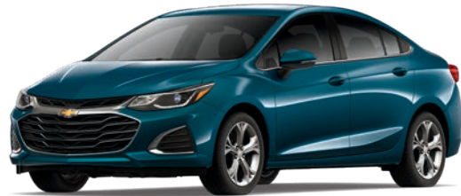
PACIFIC BLUE METALLIC 1,3