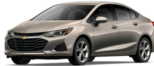
PEPPERDUST METALLIC 3,4