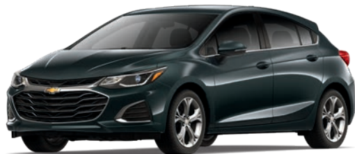
NIGHTFALL GRAY METALLIC 4,5