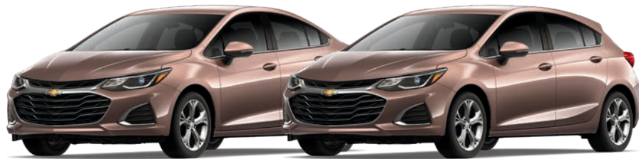
OAKWOOD METALLIC 5