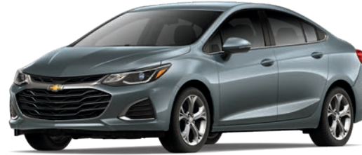
SATIN STEEL GRAY METALLIC 1,3