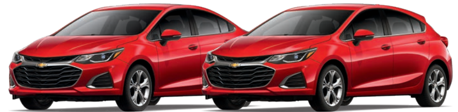
RED HOT 5