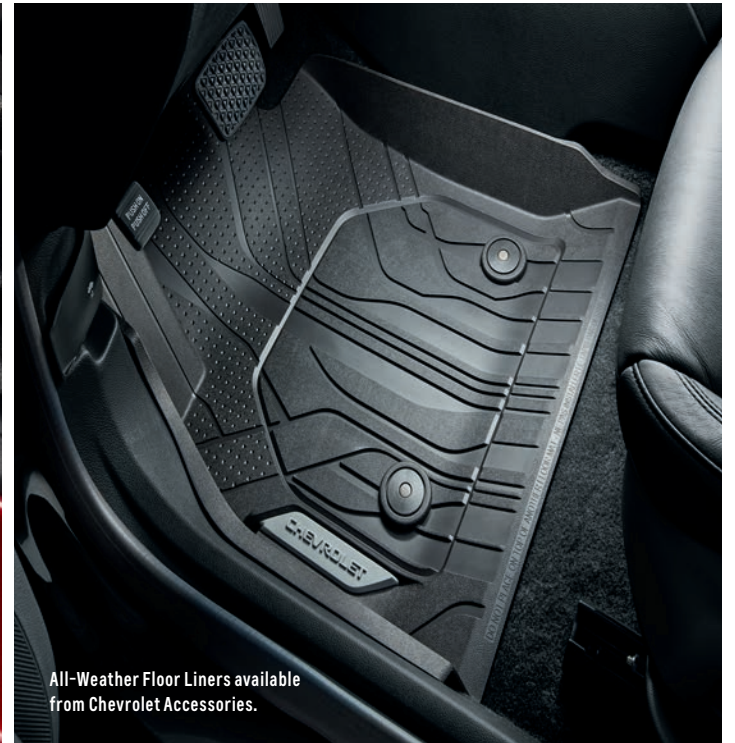
All-Weather Floor Liners available from Chevrolet Accessories.