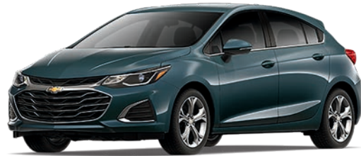
GRAPHITE METALLIC 1,2