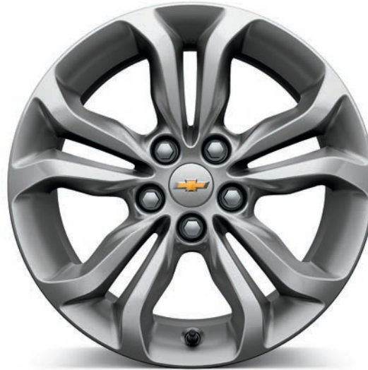
16" Aluminum (Standard on LT and Diesel; included with LS Convenience Package)