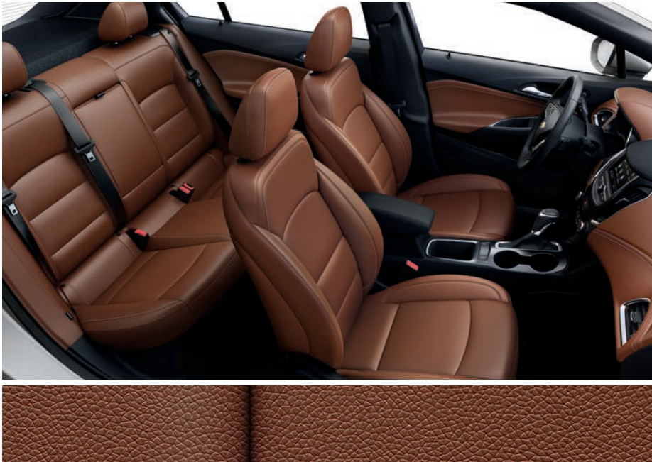
Umber Leatherette with Jet Black Accents 1,2