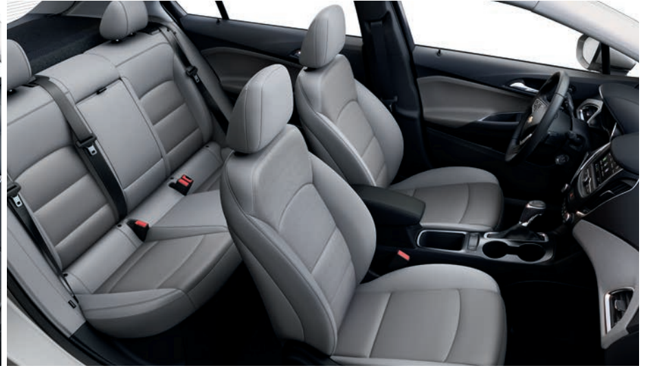
Galvanized Leatherette with Jet Black Accents 1,2